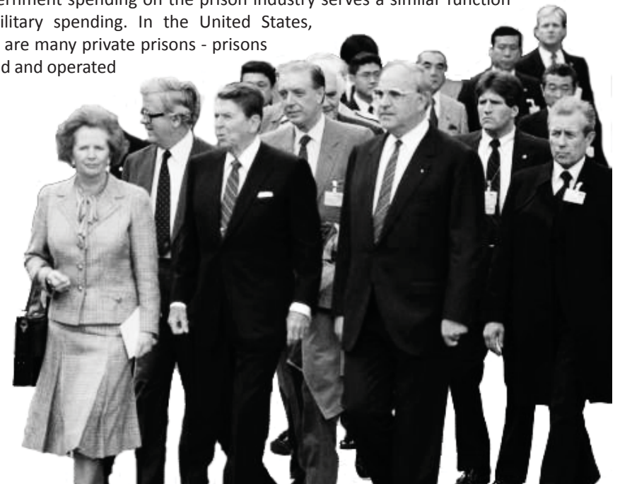
• Margaret Thatcher, Ronald Reagan - G8 Meeting - 1985 Bonn, Germany

Government spending on the prison industry serves a similar function as military spending. In the United States, there are many private prisons - prisons owned and operated