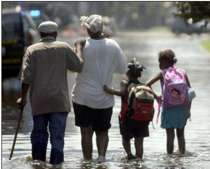
One Thousand Emotions PO Box 63333 St. Louis, MO 63163 USA