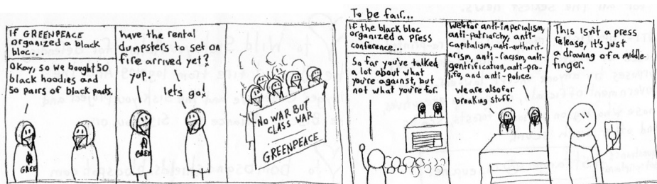
Cartoon from the wonderful Super Happy Anarcho Fun Pages : www.tangledwilderness.net

(The mutiny zine collective does not necessarily agree with all the opinions of contributors. Contributors do not necessarily agree with all the opinions of the mutiny collective. The mutiny collective doesn't agree with all the opinions of the mutiny collective.)