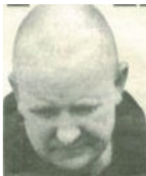
Watmough - Fascist 'Hard Man'? Don't make us laugh!

bedroom because he's taken a new picture from Indymedia, and any threat. Despite the occasional secret gatherings of inbred swastika-wearing morons, the far-Right are not in a position to carry out their pathetic fantasies.