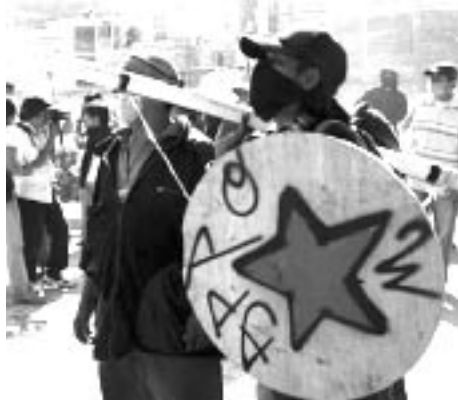
Oaxacan Rebels During 1-hour battle to defend Radio Universidad from Federal Police. Nov. 2nd, 2006.

According to Naomi Klein in her article "Zapatista Code Red" in The Nation , "researchers at the Center of Political Analysis and Social and Economic Investigations have been tracking with their maps and charts. On the fifty-six permanent military bases that the Mexican state runs on indigenous land in Chiapas, there has been a marked increase in activity. Weapons and equipment are being dramatically