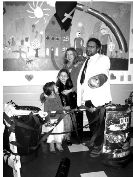
"Somewhere over the barricades" POG's Anarchist Prom, February 2007 very favorable articles in Pittsburgh's corporate media.

tor of the National Robotics Engineering Center, a mainly Pentagon-funded branch of Carnegie Mellon University (CMU) that develops robotic vehicles and weapons delivery systems for the US Army and Marines. NREC recently received a $14 million contract to further develop "Crusher," a new generation of unmanned offensive ground weapons for the army. This further moves CMU toward not just research, but direct design and production of killing machines. Seventeen people attended the demonstration, local law enforcement recorded the protesters from a distance, and the event garnered two