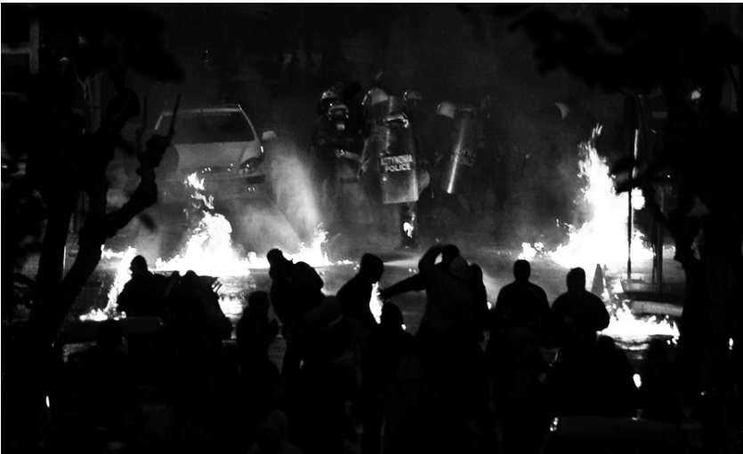
Uprisers build fires to cancel out tear gas