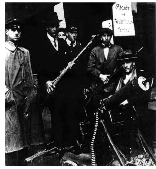
"The soviet is the place of silence" (Brice Parain)

Guard Post in front of the central train station during the second council republic of Munich