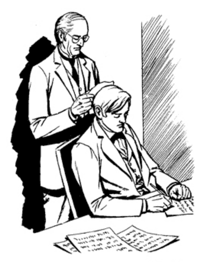
"Write What I Tell You To Write."

Zengakuren, the organization of revolutionary students, and