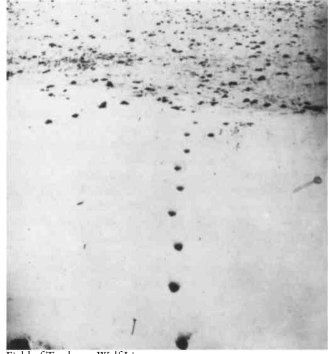
Field of Tracks, or Wolf Line