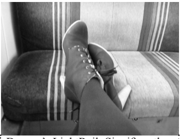
Denver's LightRail: Significantly more comfortable when free to ride.

For those that never ride it, the basics. The Light Rail is run on an enforced honor system... that is, you are "expected" to buy a ticket on the machines but you don't have to get past anyone to get onboard (rumor has it that sweetened coffee down the coin slot can make them inoperable, but that's unconfirmed). <<< cont. pg. 7