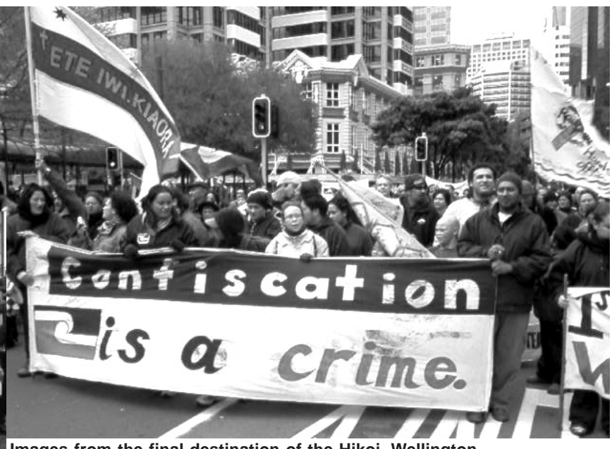
Images from the final destination of the Hikoi, Wellington.

ESTIMATES of between 15,000 (by police) all the way up to 30,000 were made of the final day of the Hikoi as it reached Wellington on May the 5th.