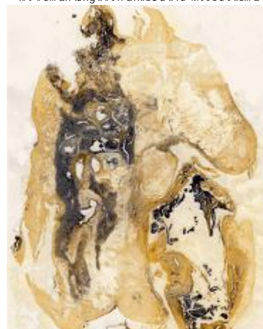
The human lung when afflicted with Mesothelioma

After more than a year of delegation, an out-of-court settlement has been reached by the Tunnel Rats and The Architect of the Capitol, the terms of which are confidential. However, the agreement covers only the workers' whistle blowing claims. It does not address the serious physical injuries the crew has suffered from dozens of years of exposure to asbestos and other toxins. No matter the dollar amount, there will be no resolution that will repair the unimaginable damage done to these workers lives and bodies, not to mention the potential damage done to their families and quite possibly the vast majority of the citizens of the District of Columbia.