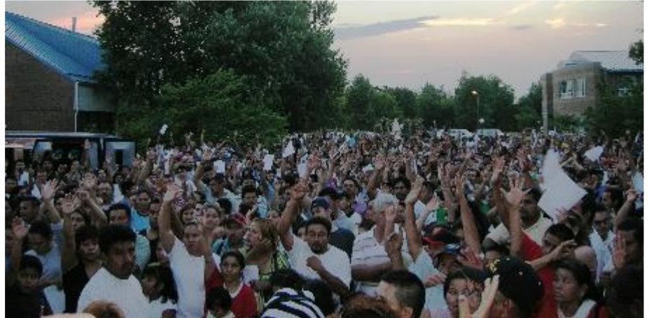
Thousands of immigrants and workers gathered together in protest of anti-immigrant solutions passed earlier this year in Prince William County, Virginia

These ramblings have gained a lot of strength as of late, particularly in the counties of Fairfax, Loudoun, and Prince William of Northern Virginia. Loudoun and Prince William have already passed measures banning social services to anyone who is of illegal status, and Prince William County has enacted 287(g), and required police to perform background checks on anybody of "reasonable suspicion" of being undocumented. It even allowed residents to sue the county for any public department they thought provided services to illegal immigrants. Prince William's resolution has received much controversy from not only the Hispanic immigrant community, but from the Virginia working class in general, with as much as 10,000 people turning out at a time to contest the resolution, causing many stipulations to be removed, most notably that residents could no longer sue, and that