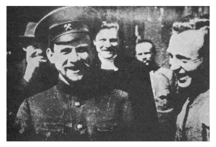
Members of the Kronstadt Rising