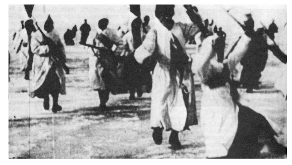
Troops attacking Kronstadt