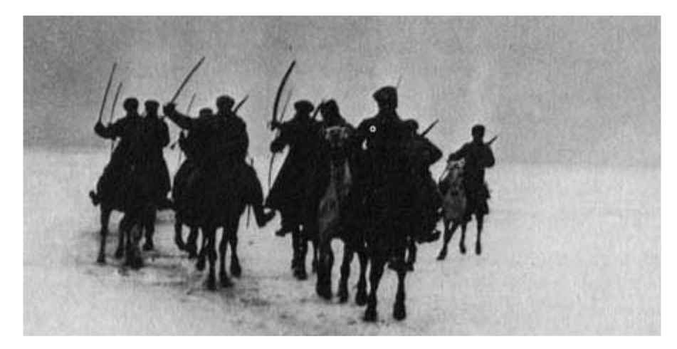
Launching their attack on Kronstadt on the night of 17th March 1921

Catastrophe could still have been averted during those tragic days: Why then did the Petrograd Defence Committee use such abusive language? The only conclusion an objective observer can come to is that it was done with the deliberate intention of provoking bloodshed, thereby 'teaching everyone a lesson' as to the need for absolute submission to the central power.