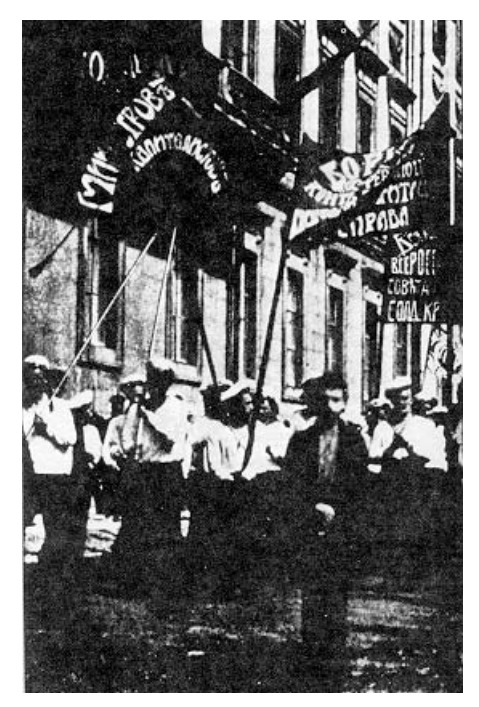
The Kronstadt Sailors in 1917