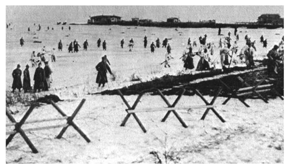
The quelling of the Kronstadt rising, Red army units crossing the ice