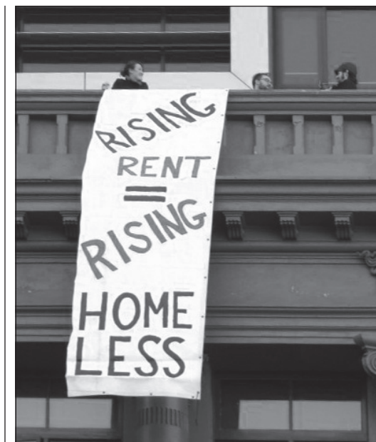
Banner drop on May 1st, 2010.

Some rooming house operators are taking advantage of the situation by setting up short term rooms for very high rents in appalling conditions. In January 2008 three international students died in a rooming house fire in