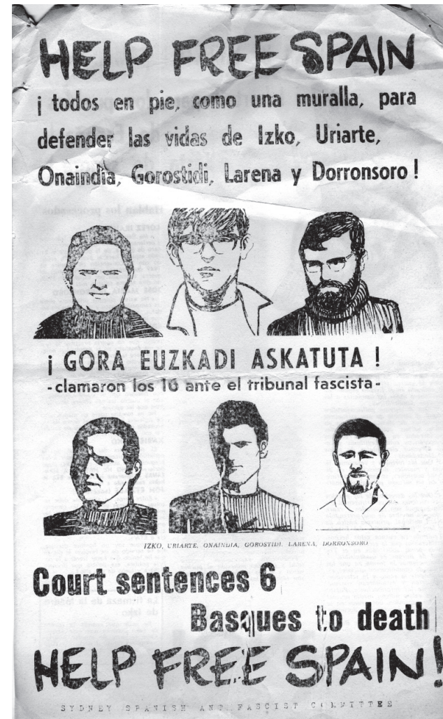
A poster distributed by the Sydney Anti-Fascist Committee, early 1970s.

in the dining room. We ate three (excellent) vegetarian meals a day on two long tables, seated side by side and face to face. Despite being well fed, and having no exercise apart from strolling up and down a muddy hillside, we were always hungry at mealtime. The architecture suggested community. You had no choice but to sit shoulder-to-shoulder with, hopefully, comrades. And yes, there was a sing-along. Some people even thought to bring beer. I couldn't help thinking that the setting, and the schedule (wake up, eat, talk politics, tea and a fag, talk politics, more fags, eat, talk politics, eat, talk politics, put the kettle on, etc), were as