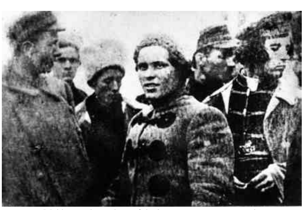
Makhno and members of the insurgent army command