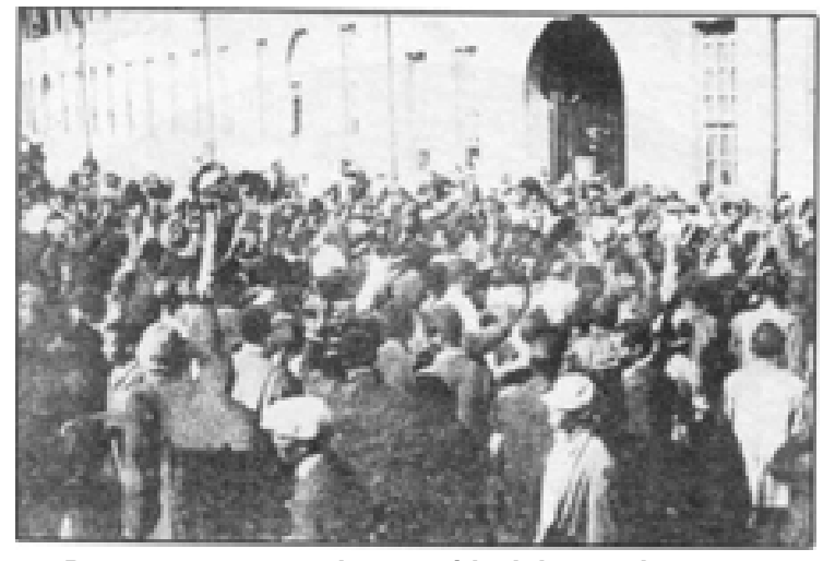
Pass protestors gather outside Johannesburg pass office in March 1919

In its heyday, the 1890s to the 1930s, the classical anarchist/revolutionary syndicalist movement was not just an international, and multi-national movement. It was also openly and consistently internationalist, and anti-racist.