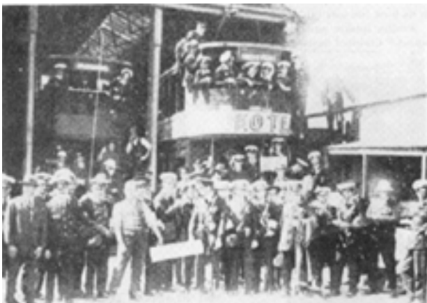
emerged out of a split in IWW tramway strikers pose just before coming the South African Labour out in 1911

These groups disappeared around 1913, and were superseded by the International Socialist League in September 1915. The International Socialist League emerged out of a split in the South African Labour Party. Although nominal-