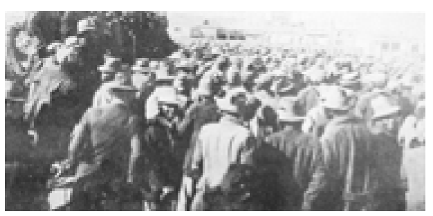
July 1918 mass IWA / SANNC / ISL rally