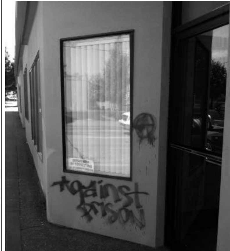
Department of Corrections building on 6300 block of 35th Ave SW after the attack

There are two new controversial, multi-billion dollar projects in process in Seattle-the Alaskan Way Viaduct Replacement and the Combined Server Overflow Reduction Project. Both projects supposed aim is to improve city/ county infrastructure to solve current City-identified problems, and both rely on advanced technology to do so. The urban way of life created the problems government institutions are now trying to solve in typical short-sighted fashion. The city's inherent ecological and social troubles are ignored, and the priority of those in power-maintaining Seattle as a node of capitalism-remains paramount.