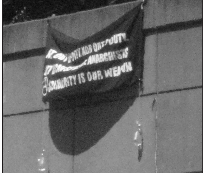
above: Banner hung in view of King County Jail on July 23rd

Solidarity is not a moral obligation, it is a necessity for breaking the chains that authority uses to tie us down. Together, people can remind each other that it is not them alone against the system, but a vast wave of fire.